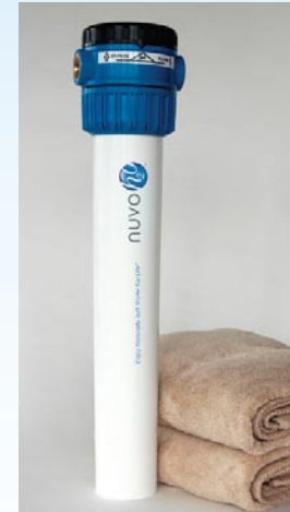
Amazingly small—perfect for apartments, condos and other limited spaces.