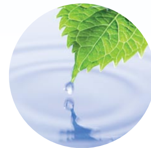
Healthy for you, your family and the environment.