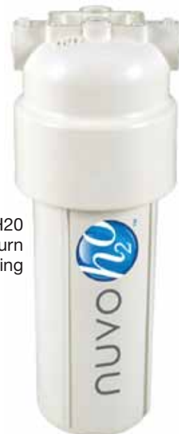
nuvoH2O Half-Turn Housing